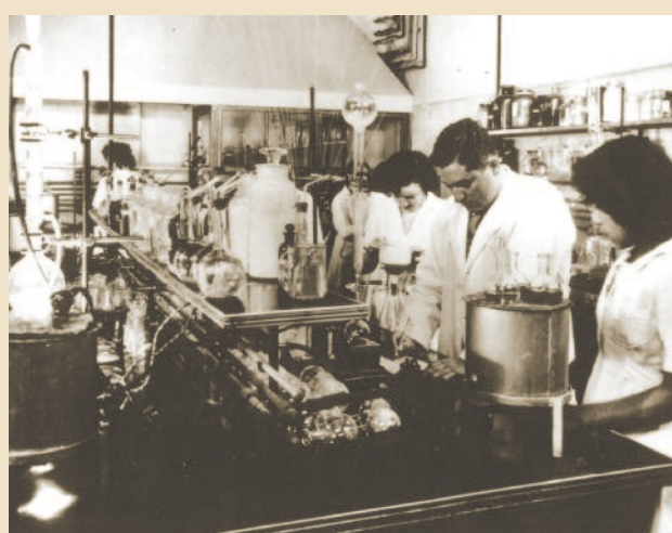
Carl Djerassi and laboratory workers at Syntex S.A., Mexico City, 1950.

By the 1950s, Syntex and its competitors in Mexico* were producing more than half the sex hormones sold in the United States. Syntex's economic success was matched by its sci-